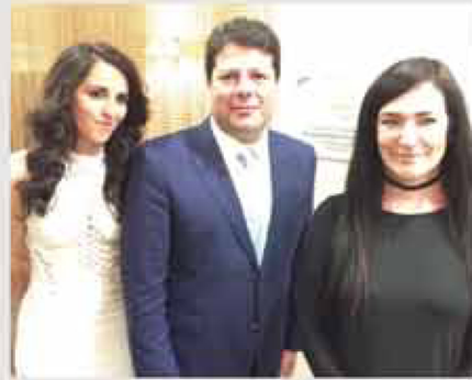
The Chief Minister, The Hon Fabian Picardo QC MP pictured with Carreras and Olivera at the official inauguration of Mayfair On Main, 6th April 2017