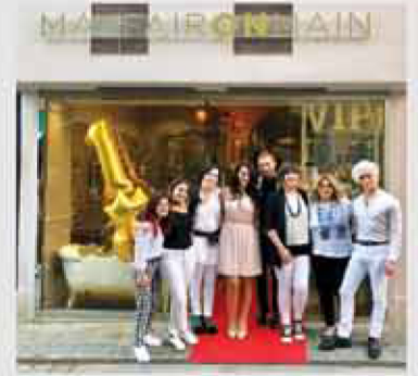
The MoM Team preparing to receive their guests